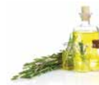
Sauce dressing on side Vinaigrette servie à part

Salade océane : assortiment de salades, saumon fumé, pétoncles, crevettes grillées, tomates cerises, quartiers de citron vert et jaune, crème d'aneth